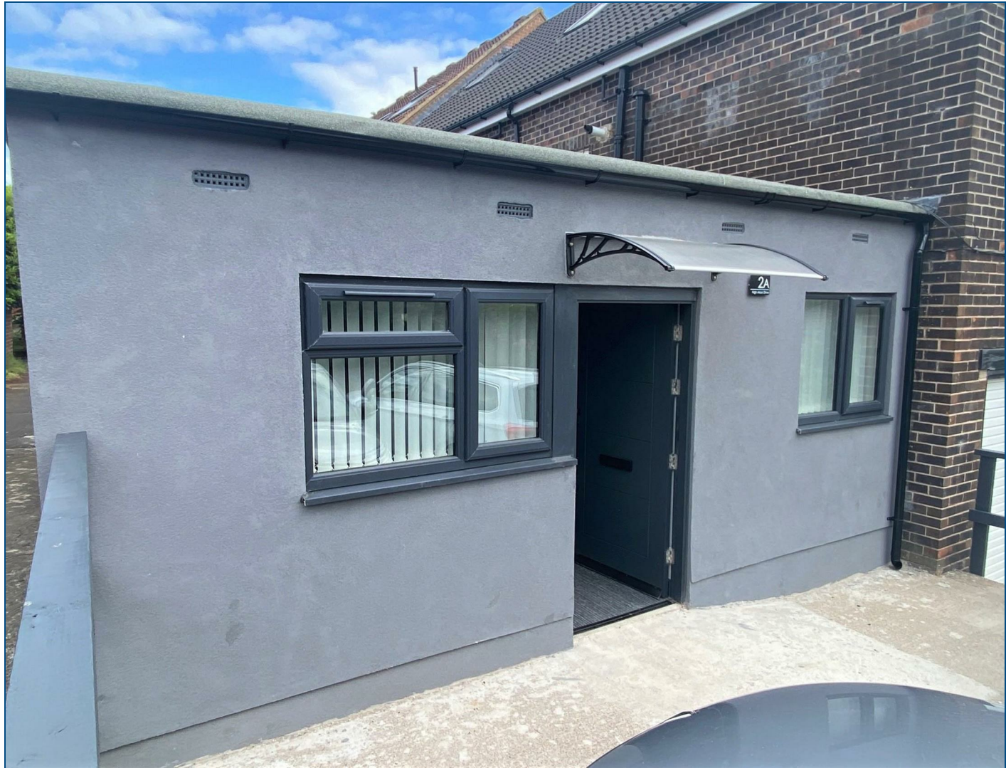
2a, High Moor Drive, LS17 6EB